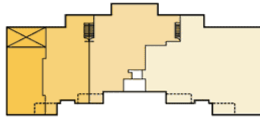
Ground Floor 2595 Skymark Ave.