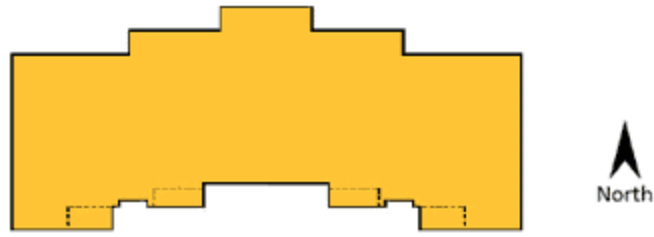
Ground Floor 2595 Skymark Ave.