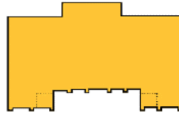
Ground Floor 2585 Skymark Ave.