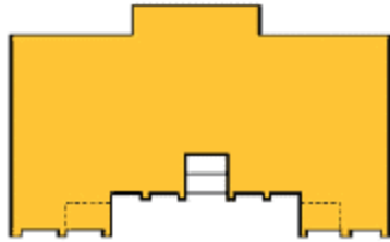
Ground Floor 2605 Skymark Ave.